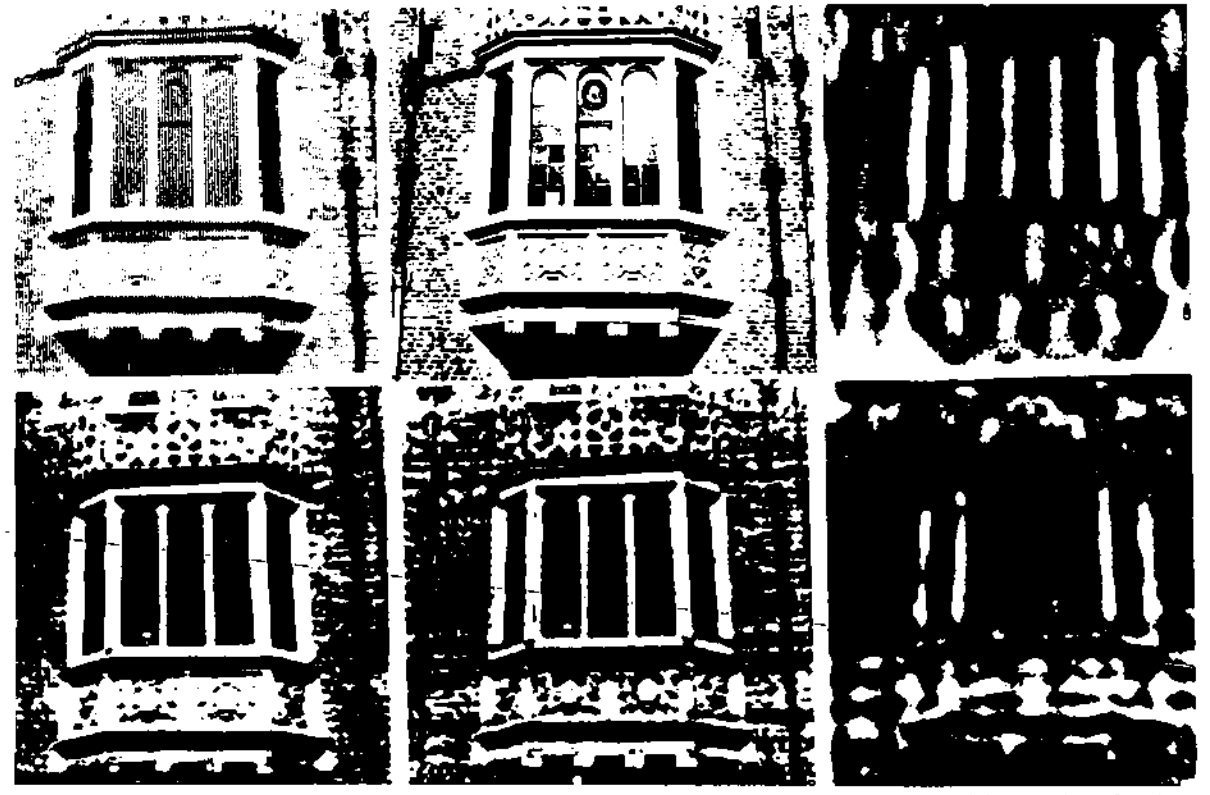
Fig. 3. A reconstruction of a picture by computer using lines only (right upper), lines and corner (right lower), and various bands of frequency (the four figures on the left). Note the marked improvement in resolution and detail when reconstruction is by the spatial frequency method.