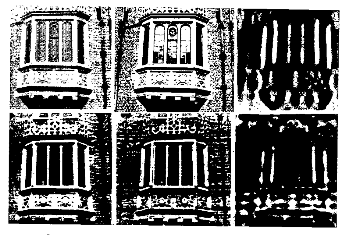
Figure 3: A reconstruction of a picture by computer using lines only (right upper), lines and corner (right lower), and various bands of frequency (the four figures on the left). Note the marked improvement in resolution and detail when reconstruction is by the spatial frequency method.